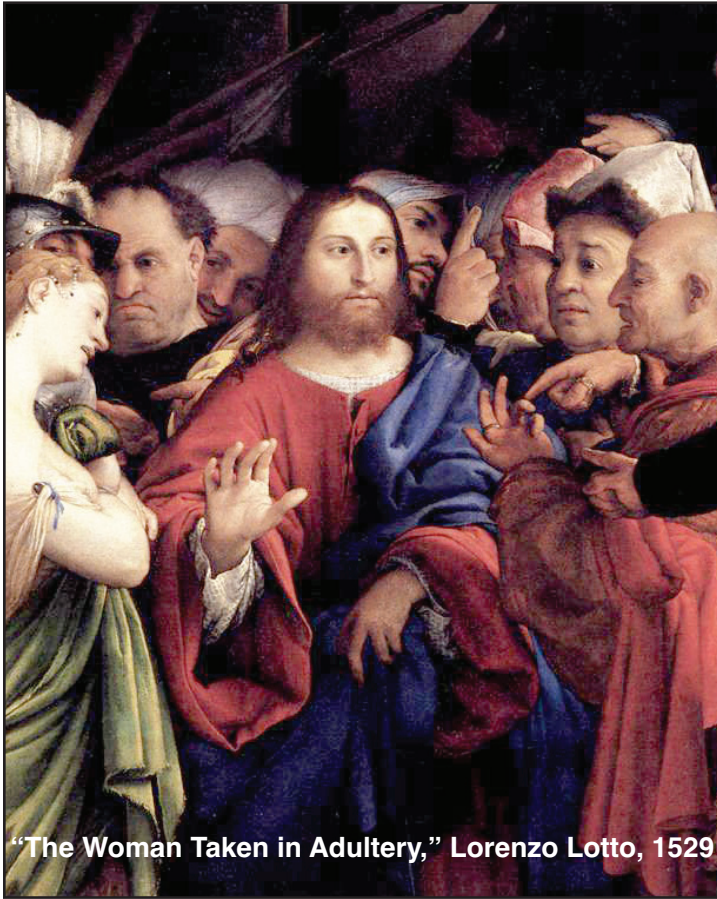
“The Woman Taken in Adultery,” Lorenzo Lotto, 1529

St Basil's Parish was founded in 1856 by the Priests of the Congregation of St. Basil, also known as the Basilian Fathers. We are the collegiate church of the University of St. Michael's College at the University of Toronto, as well as being the parish church to our parishioners who come to worship here from all over the city. We strive to live the Gospel with the Basilian values of goodness, discipline and knowledge; and to live with their tradition of hospitality to all who visit here.